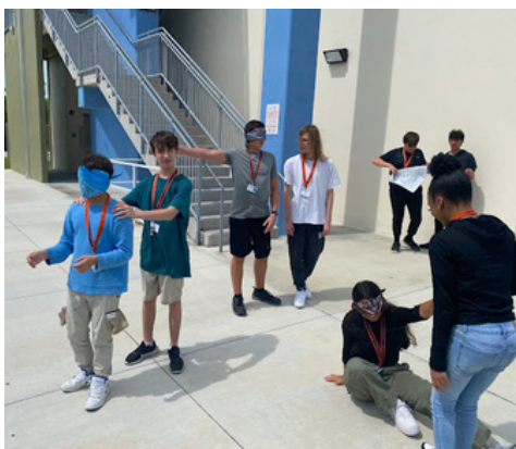
9th grade students in blind trust walk activity.

On Fridays, students often get opportunities to practice their problem solving and collaboration skills. These activities also create laughter and fun as students learn to think creatively and critically.